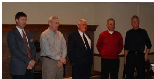
Top Six Contingencies Bonus Agencies For 2007:

Farmers Mutual Insurance Company hosted an awards presentation dinner on January 24, 2008. The meeting was hosted at the company's home office. The company invited the following top twenty contingency recipients for 2008 to the awards presentation: